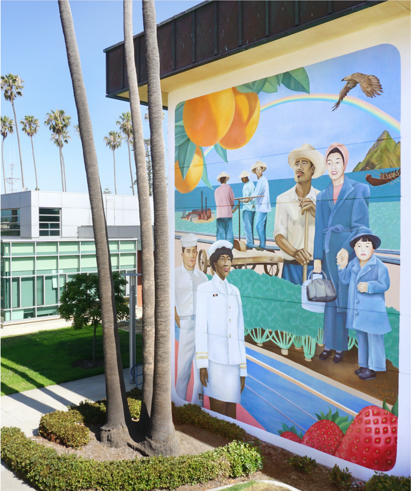
California Immigrants , mural on Oxnard City Hall. Oxnard, California. 2021